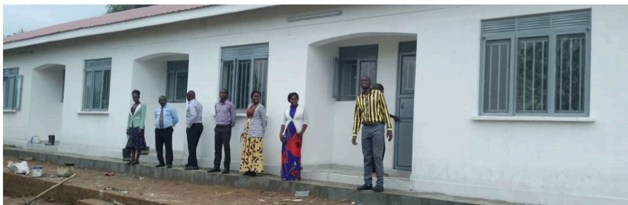
STACE Teachers Celebrate Newly Constructed Teachers' Quarters Residence

We are pleased to announce that the construction for the new teachers' residence at St. Thomas Aquinas College in Erepí, Uganda has been completed. This significant milestone will immensely benefit our campus community. The teacher's residence will accommodate six teachers who will be able to reside on campus providing increased support and security for the nearly 700 students who are being educated and who also reside on campus. This project was made possible thanks to the generous donations received through the paddle raise at the 2023 Grow and Harvest Gala, as well as other contributions received through our mission fund. The new residence not only enhances the living conditions for the teachers but also creates a more conducive learning environment for the students at the college.