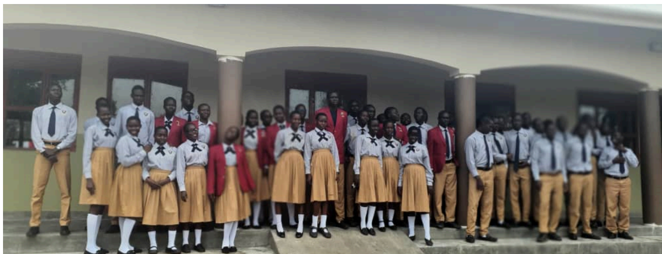
STACE students are pictured on STACE Campus outside of the newly constructed Classroom Block

In addition to the completion of the teachers' quarters, construction of an additional classroom block was also completed. The new classroom block will provide classroom space for one hundred students. This space was made possible by the generosity of a selfless individual who has long believed in and supported E3 Africa's mission to educate, empower and enrich the lives of the orphaned and impoverished children in Uganda.